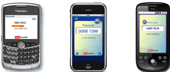
RSA SecurID software tokens for smartphones

RSA SecurID software tokens are available for a variety of smart phone platforms including BlackBerry®, iPhone®, Android®, Nokia®, Windows® Mobile, Java™ ME, and Symbian OS and UIQ devices.