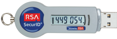
RSA SecurID 800

The RSA SecurID 800 offers the one-time password functionality of the other hardware authenticators and can be used for storage of Windows® username/password credentials and digital certificates—creating a master key for multiple authentication methods. When connected, the RSA SecurID 800 is enabled for automatic token code entry, allowing applications to programmatically access token codes directly off the device and eliminating the need for the user to type their code.