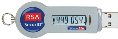
RSA SecurID 800

The RSA SecurID 800 offers the one-time password functionality of the other hardware authenticators and can be used for storage of Windows® username/password credentials and digital certificates—creating a master key for multiple authentication methods. When connected, the RSA SecurID 800 is enabled for automatic token code entry, allowing applications to programmatically access token codes directly off the device and eliminating the need for the user to type their code.