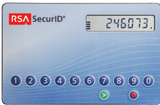
RSA SecurID 900

The RSA SecurID 900 combines the industry-proven features of RSA SecurID hardware authenticators with a light transaction signing function to strongly protect business transactions. End-users can use a unique token code that changes every 60 seconds to add additional security while logging into a financial application. Additionally, end-users can also protect an individual financial transaction by marking it with a transaction-specific digital signature.