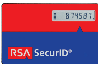
RSA SecurID 200

The RSA SecurID 200 is the original RSA SecurID hardware token. This business card holder-sized device provides the same excellent performance guaranteed from every RSA SecurID authenticator.