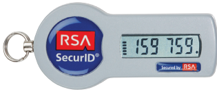
RSA SecurID 700

The RSA SecurID 700 is a small key fob that connects easily to any key ring and fits into a user's pocket or small carrying case.